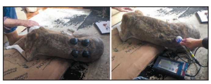
Billy during cupping and LASER therapy.

Cupping was used during Billy's first 2 rehabilitation sessions to reduce tension and trigger points in the muscles of the lumbar region, from approximately T13-L6. Four large RockPod cups were applied with a plunger technique to the bilateral lumbar longissimus muscles with ultrasound gel emollient applied generously to edge of cup rims. The rehabilitation practitioner alternately applied gentle traction with circular rotation of the cup bells for 30 second repetitions. Fasciculations were observed cranial to the cups on the right-side following initiation of rotations and repeated after the rest phase. Upon removal of the cups, following 2 minutes of treatment, palpation revealed reduction in tightness of the epaxial muscles of the lumbar region. Upon removal of the cups at the following session, moderate tension was noted to be further reduced to mild tension.